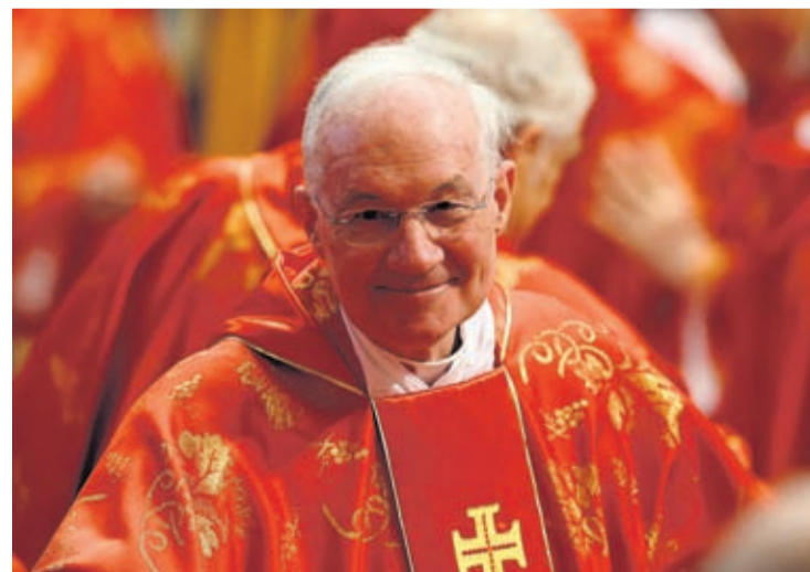
Canadian Cardinal Marc Ouellet attends a Mass for the election of a new pope celebrated by Cardinal Angelo Sodano, not pictured, inside St. Peter's Basilica, at the Vatican, Tuesday, March 12, 2013.